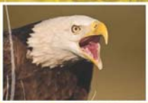
Birds of Prey Exhibit

Pancake Breakfast 9-11A, Adults $4, (3 Pancakes, Coffee And Sausage). Children 10 And Under $2.50, (2 Pancakes And O.J.)