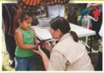
Live Reptile Exhibits