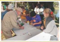
Live Animal Exhibits