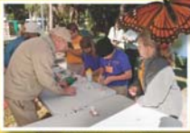
Nature Activities for Kids