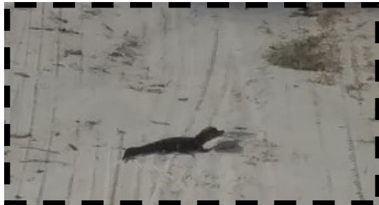
Caught this picture of a baby gator crossing the trail I assume looking for his siblings and Mom. Babies are not on their own at this age.