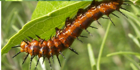
Gulf Fritillary Caterpillar From the garden!